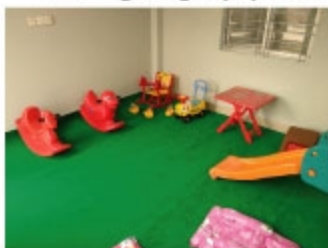
Child Care Facility