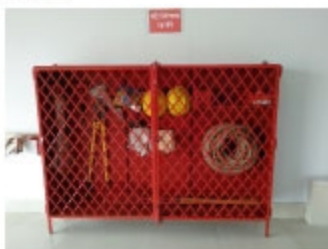
Fire Fighting Equipment