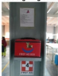
First Aid Equipment at Floor