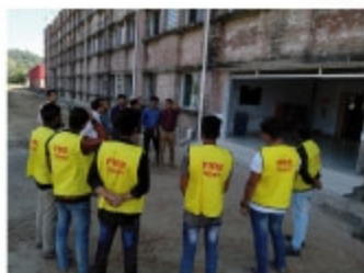
Fire Fighting Team