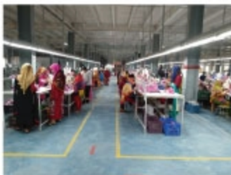
Proper Floor Marking