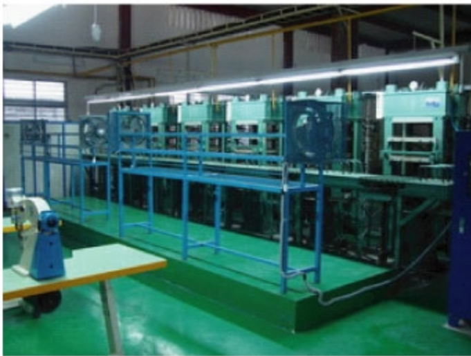
Auto hot press