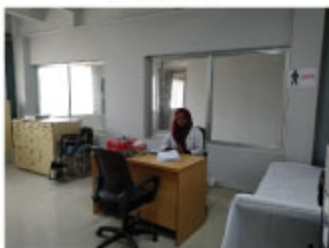
In-House Medical Facility